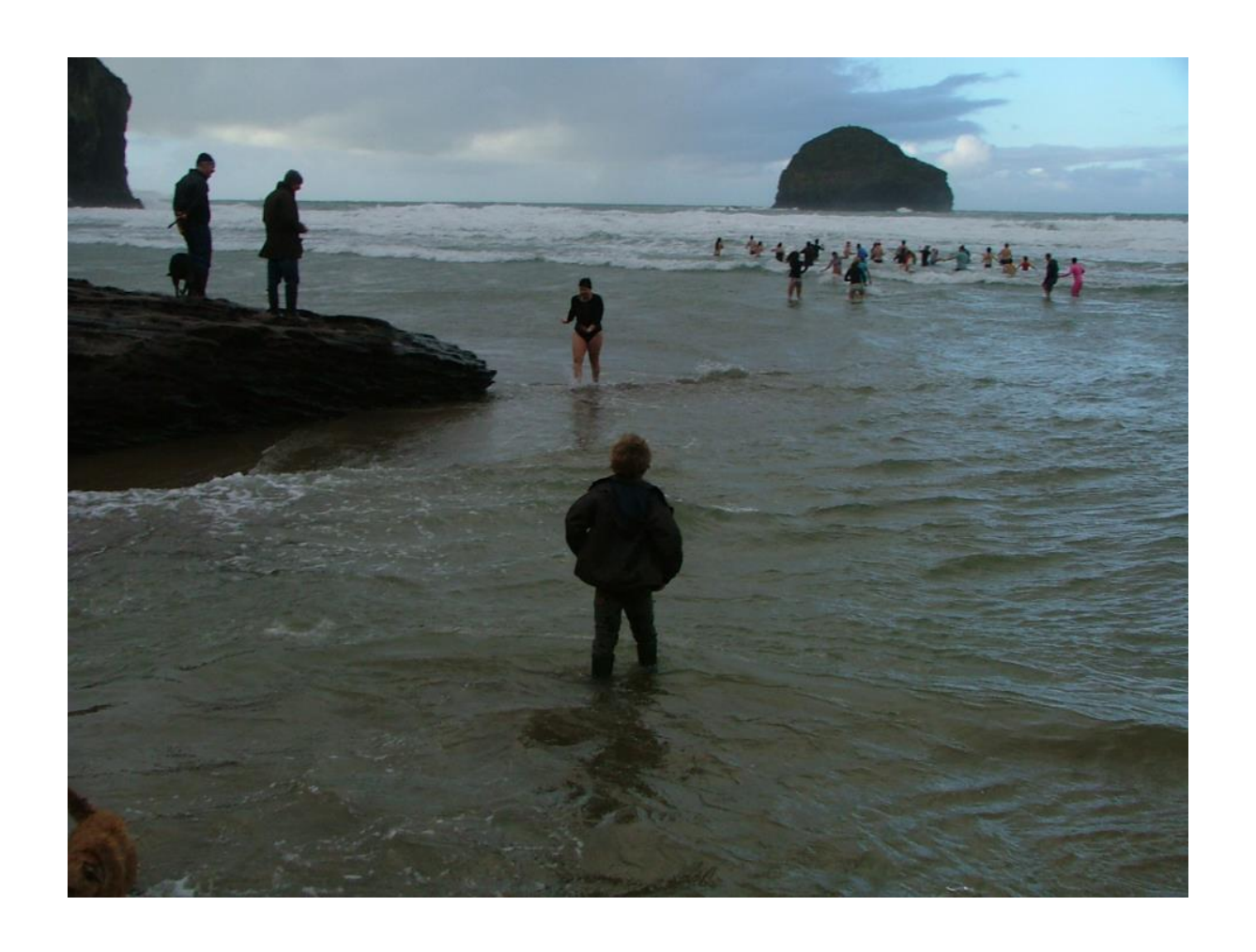
"Christmas Day Dip for Members and parents"